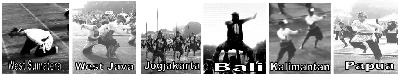
Picture: typical dance and martial arts illustrations

Contribute to sports science in Pencak silat Nusantara dance body fitness levels will have a positive effect on appearance. To achieve good body fitness needs to be done regular, directed and programmed exercises. Body fitness can be defined as a person's ability to perform physical activity in a long time without experiencing significant fatigue. These physical activities include running, walking, working, including dancing and more. Dancing requires good physical support. Physical abilities include strength, endurance, balance, flexibility and others. For the preparation of PSN dance so as not to cause injury and the emergence of health problems, then in the preparation also pay attention to supporting science such as anatomy, physiology, kinesiology and mechanics, physical condition and fitness body. [9] developmental dance movement can provide opportunity for physical, cognitive advancement for young children. Investigating learning through developmental dance movement as a kinesthetic tool in the early years foundation stage. This is in line with that expressed by [10] that the results of his study reveal the impact of bringing rest and imagery into her dance classroom (techniques drawn from somatic practice), the teaching fellow learns how to teach anatomical awareness to her high school students and to help them apply anatomy concepts to their ballet technique.